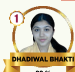
1 BHADIWAL BHAKTI 89 %