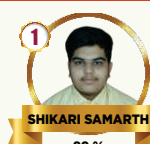
1 SHIKARI SAMARTH 89 %